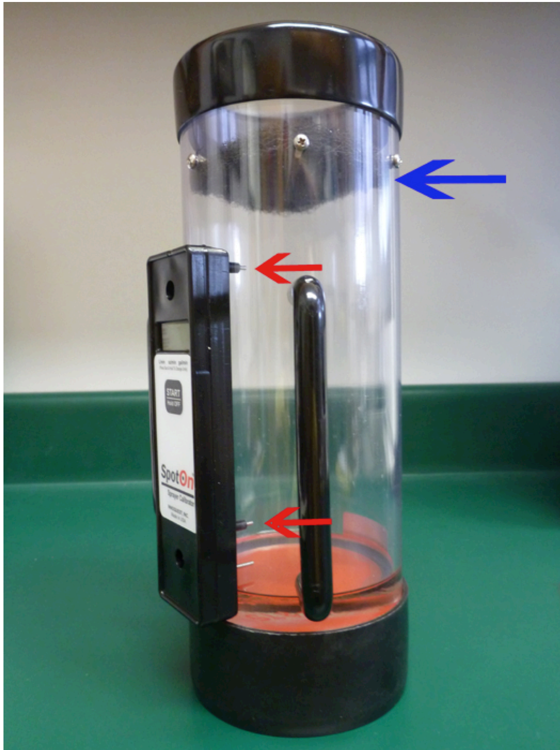
Figure 1. SpotOn™ device diffuser (blue arrow) and electrodes (red arrows).